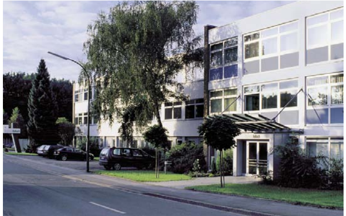
Diagramm Halbach is certified print partner of Anoto's for both offset printing (copied pattern) and digital printing (unique pattern).

Diagramm Halbach, as one of the largest manufacturers of special paper and print products, possesses excellent capacities for the design, printing (offset as well as digital printing technology) and finishing of dotforms paper.