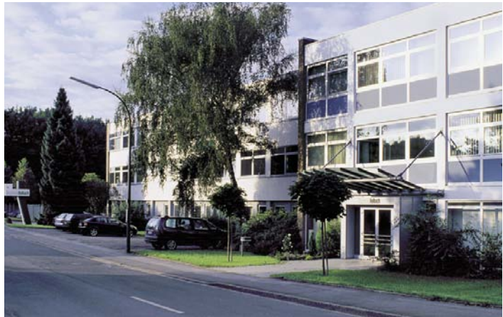
Diagramm Halbach is certified print partner of Anoto's for both offset printing (copied pattern) and digital printing (unique pattern).

Diagramm Halbach, as one of the largest manufacturers of special paper and print products, possesses excellent capacities for the design, printing (offset as well as digital printing technology) and finishing of dotforms paper.