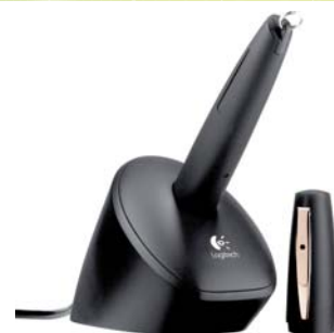
Diagramm Halbach GmbH & Co. KG

Am Winkelstueck 14 58239 Schwerte/Germany